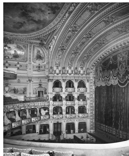
London Opera House, Kingsway, London (1911)

As places are limited you must register in advance and log-in details will be supplied prior to the event.